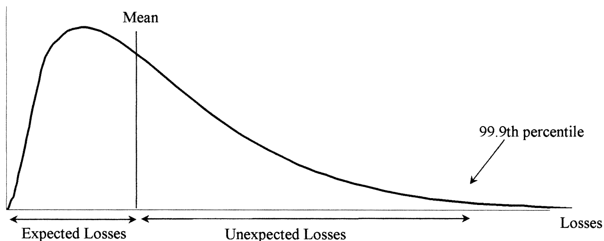
Figure 1 – Probability Distribution of Potential Losses

The area under the curve to the right of a particular loss amount is the probability of experiencing losses exceeding this amount within a given time horizon. The figure also shows the statistical mean of the loss distribution, which is equivalent to the amount of loss that is "expected" over the time horizon. The concept of "expected loss" (EL) is distinguished from that of "unexpected loss" (UL), which represents potential losses over and above the EL amount. A given level of UL can be defined by reference to a particular percentile threshold of the probability distribution. For example, in